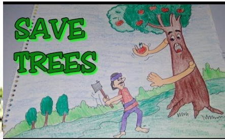
Harm me not